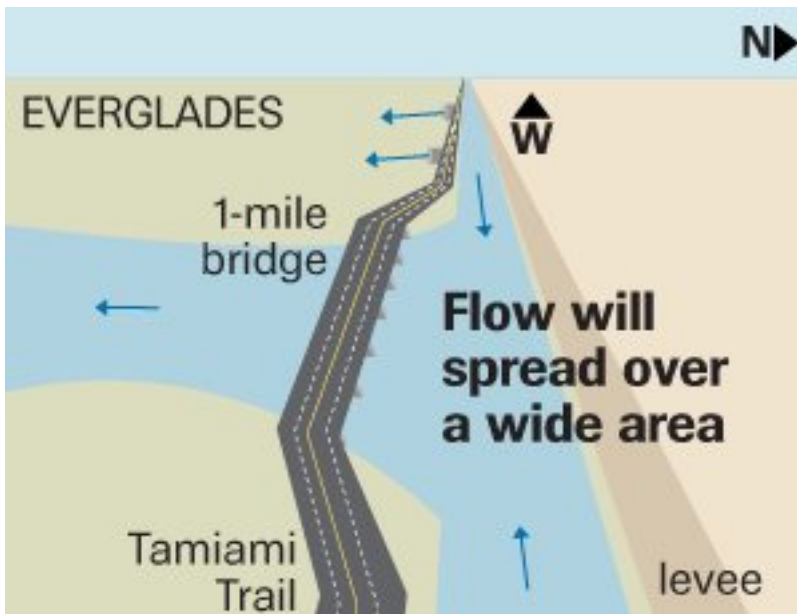
How water will flow after a bridge elevates the road.

For more information on the Tamiami Trail bridge project: