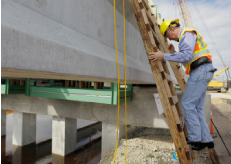
Interior Secretary Ken Salazar climbs down from inspecting the Tamiami Trail bridge project Thursday. The bridge raises the road, which has only culverts to allow water to flow.